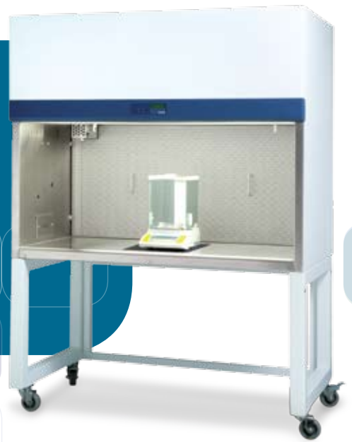
Labculture Reverse Horizontal Flow Cabinet Model RHL-4A. Shown with optional support stand.